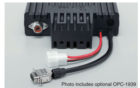
Photo includes optional OPC-1939

With the optional OPC-1939 D-SUB 15-pin ACC cable, the IC-F5026/H series can be programmed to control an operating channel from an external device (up to 16 preprogrammed channels). The ACC connector also provides an ignition sensing function, external PTT, PC command, horn honk, audio output and modulated signal input depending on programming.